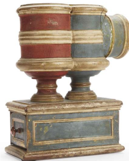
17 th Century Italian Carved Painted Ballot Voting Urn, Private Collection